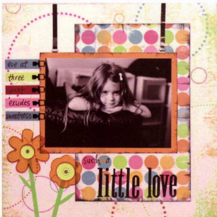
Little Love ~ Gretchen Carmack

A lot - okay most scrapbookers - OKAY ALL scrapbookers are born with the desire to capture the moment or the event on film. Let's face it, the scrapbook page is made to SHOWCASE your amazing photography skills. Photographers tend to