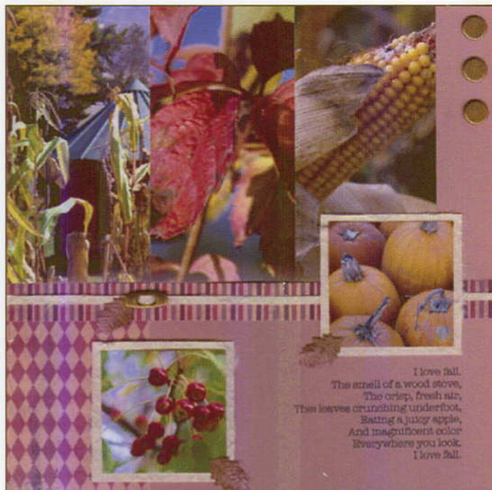
Favorite Fall Pictures ~ Kay Rogers